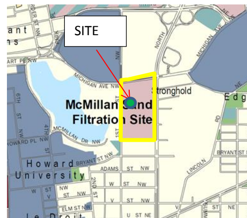
Generalized Policy Map

The Future Land Use Map designates the site for mix of uses: medium density residential, moderate density commercial and Parks, Recreation and Open Space.