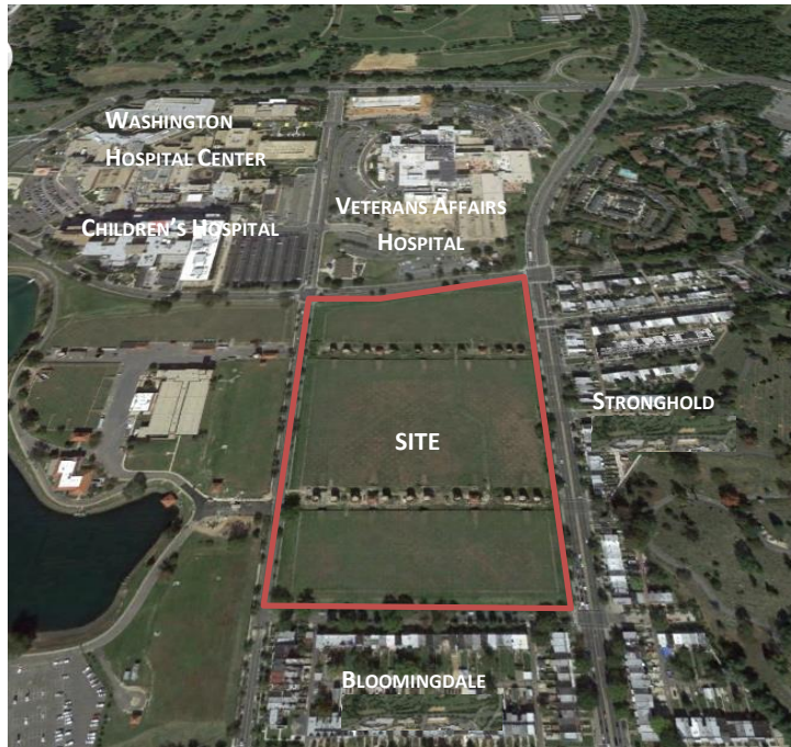
Aerial Showing McMillan Site and Surrounding Area